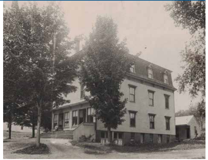
Association Hall, ca. 1900, taken from across North Main Street.

The state's historic preservation office in 1986 stated that Association Hall was potentially eligible for listing on the National Register of Historic Places. An association of