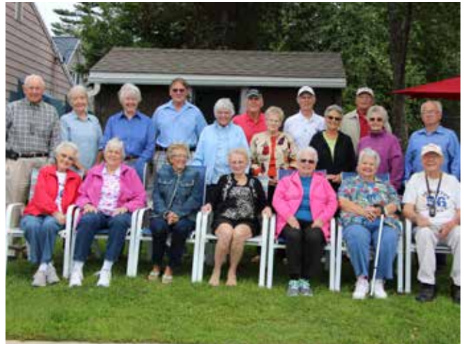
Members of the Class of 1956 gather together