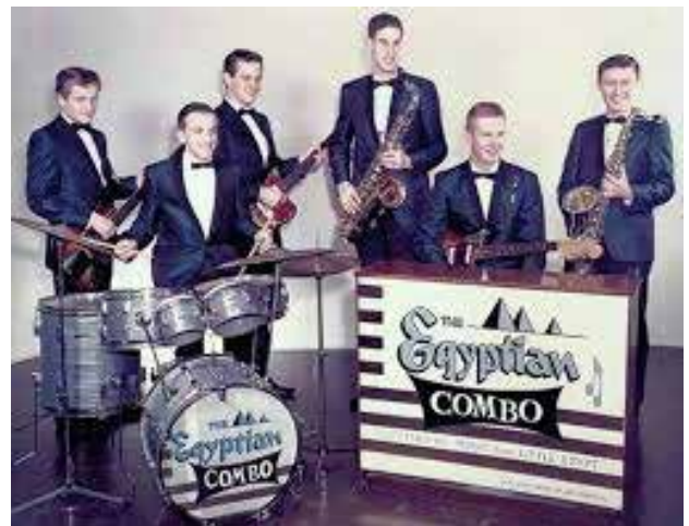
Egyptian Combo