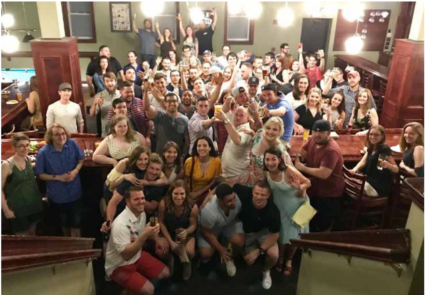
The Class of 2008 celebrates at its 10th-year reunion