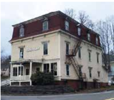
Association Hall, from Nesmith Street across North Main Street, 2018.

In addition to a drug store on the first floor (which also sold candy and tobacco products) in the 1880s and a bakery in the early 1900s, the hall on the second floor was what attracted Pinkerton students. They could attend lectures delivered by such luminaries as Dr. Oliver Wendell Holmes Sr. and Ralph Waldo Emerson or view shows by traveling performers. More important, however, was the fact that the second-floor auditorium provided the best and most convenient venue for the students' own dramatic productions and official school functions before the opening of the new Pinkerton Building in 1887 with The Chapel on the second floor.