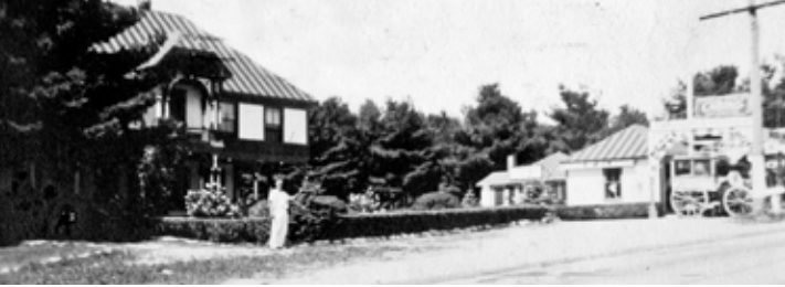
Fody's Tavern today (top) and many years ago (below).