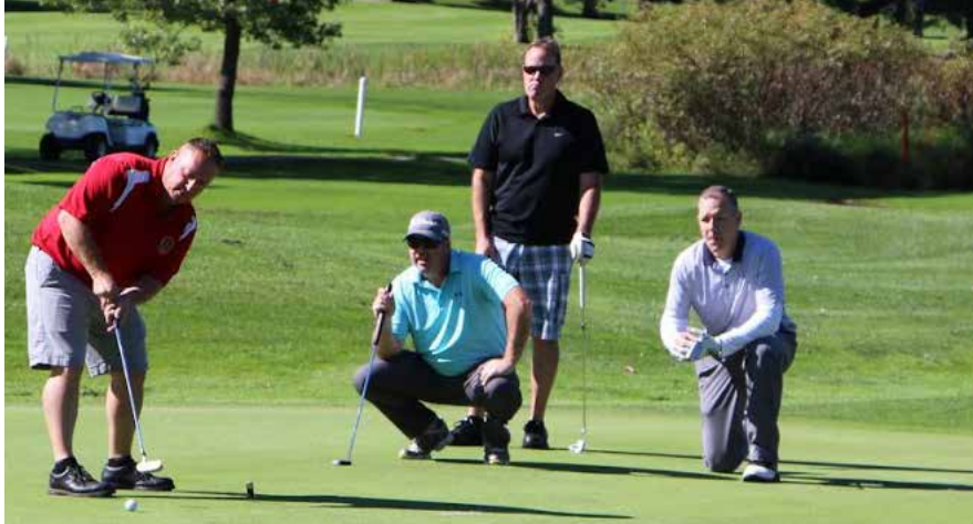
Lining up the shot, the first-place finishers well represented the class of '88.