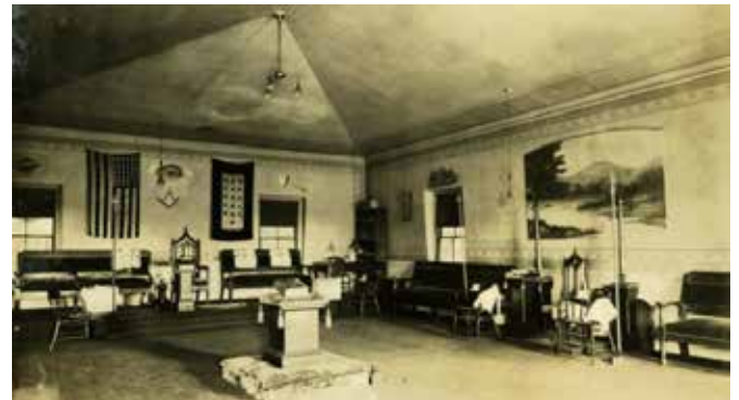
Temple of St. Mark's Masonic Lodge, Association Hall, 1924.

36 Derry businessmen and other local investors, including dairy magnate H. P. Hood, contributed their capital to construct the multi-use building in 1875. The basement and first floor held 3 stores and storage space, as well as the village post office from 1893 to 1897. On the second floor was the actual Association Hall that could be rented for banquets, plays, dances, and lectures. The third floor was graced until 1924 by the temple of Saint Mark's Lodge of Freemasons (as evidenced by the Masonic emblems on the window pediments, and scenes and symbols painted on the crumbling plaster of its interior walls).