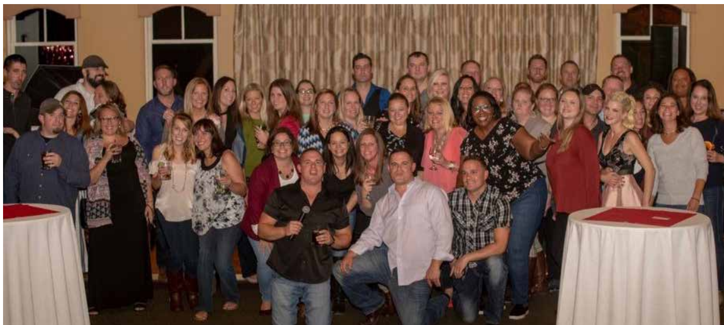
Class of 1998 - 20th Reunion